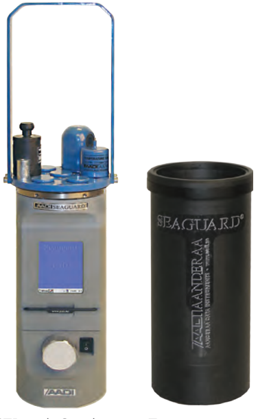
SeaGuard CTD with Conductivity, Temperature and Pressure sensors, 300 meter version.