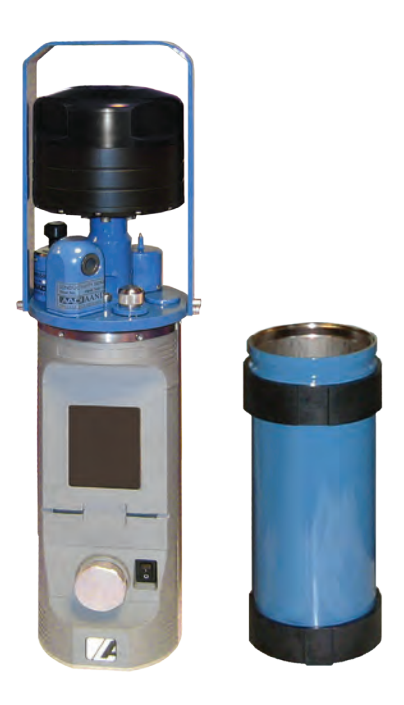
SeaGuard RCM with Doppler Current, Conductivity, Temperature and Pressure sensors, 2000 meter version.