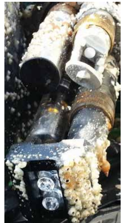
Clean sensor faces after nine months in-situ.